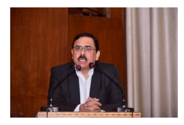
SAIL Registered Best Ever Crude Steel Production in FY 2018-19